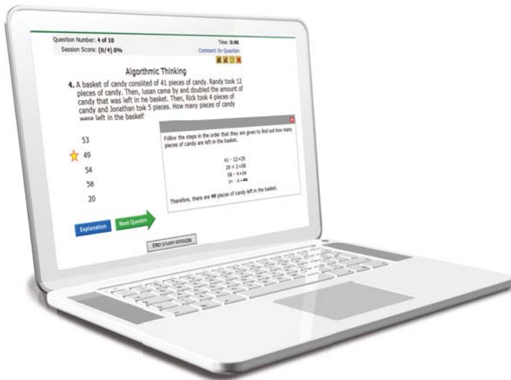
Sample PRAXIS I Review Question with Explanation

The Northstar Workforce Readiness Developmental math, reading, and writing programs help students prepare for college-level coursework. These programs are correlated to the skills tested on the COMPASS®, ASSET®, and ACCUPLACER® entrance exams.